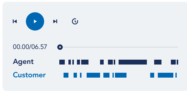
PCI redaction in call audio format

Customer Hi Kelly, I am having issues placing my order online. Can you help me?